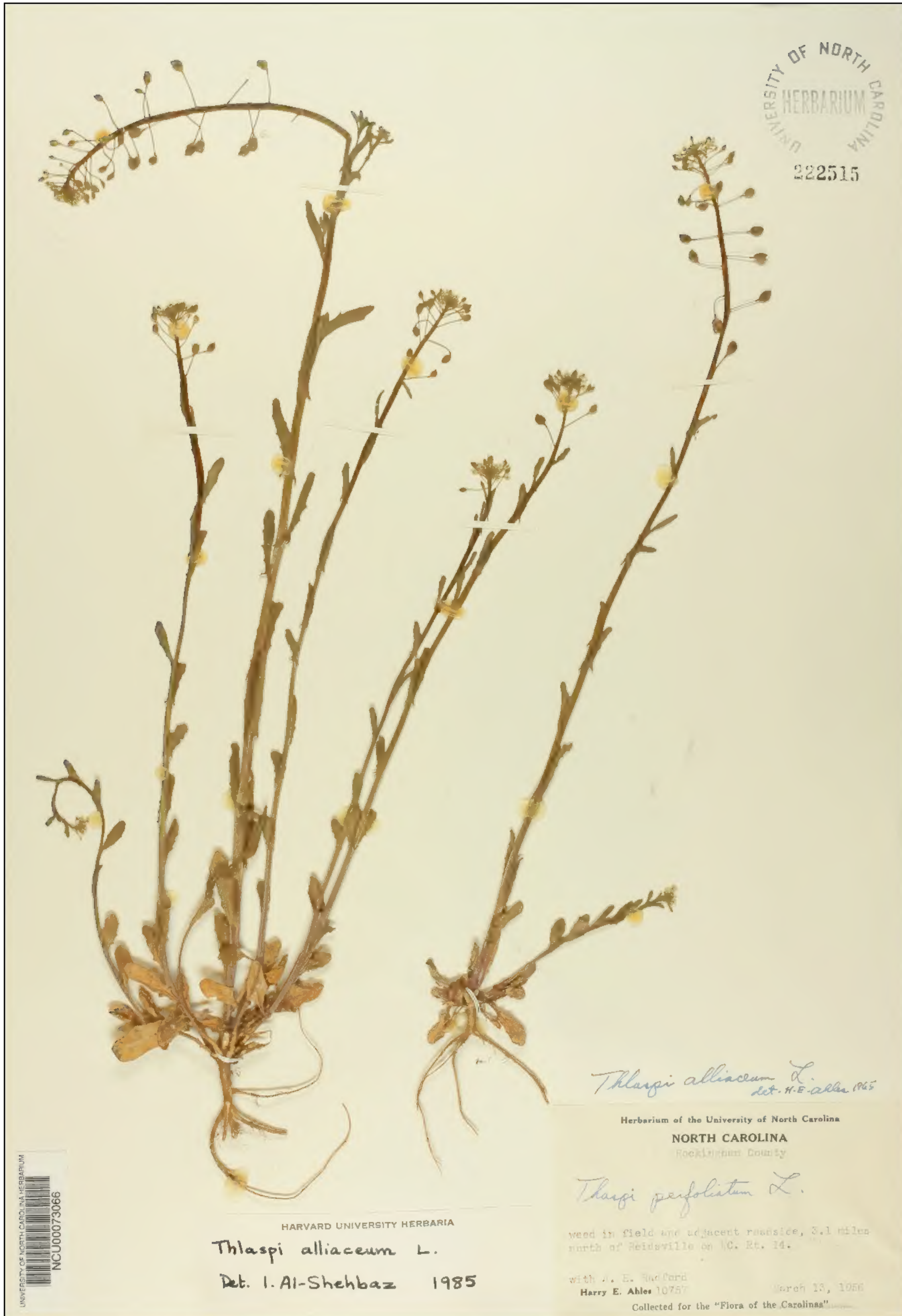
Figure 4. Thlaspi alliaceum , the North American record in Rockingham Co., North Carolina (Ahles 10757, NCU).