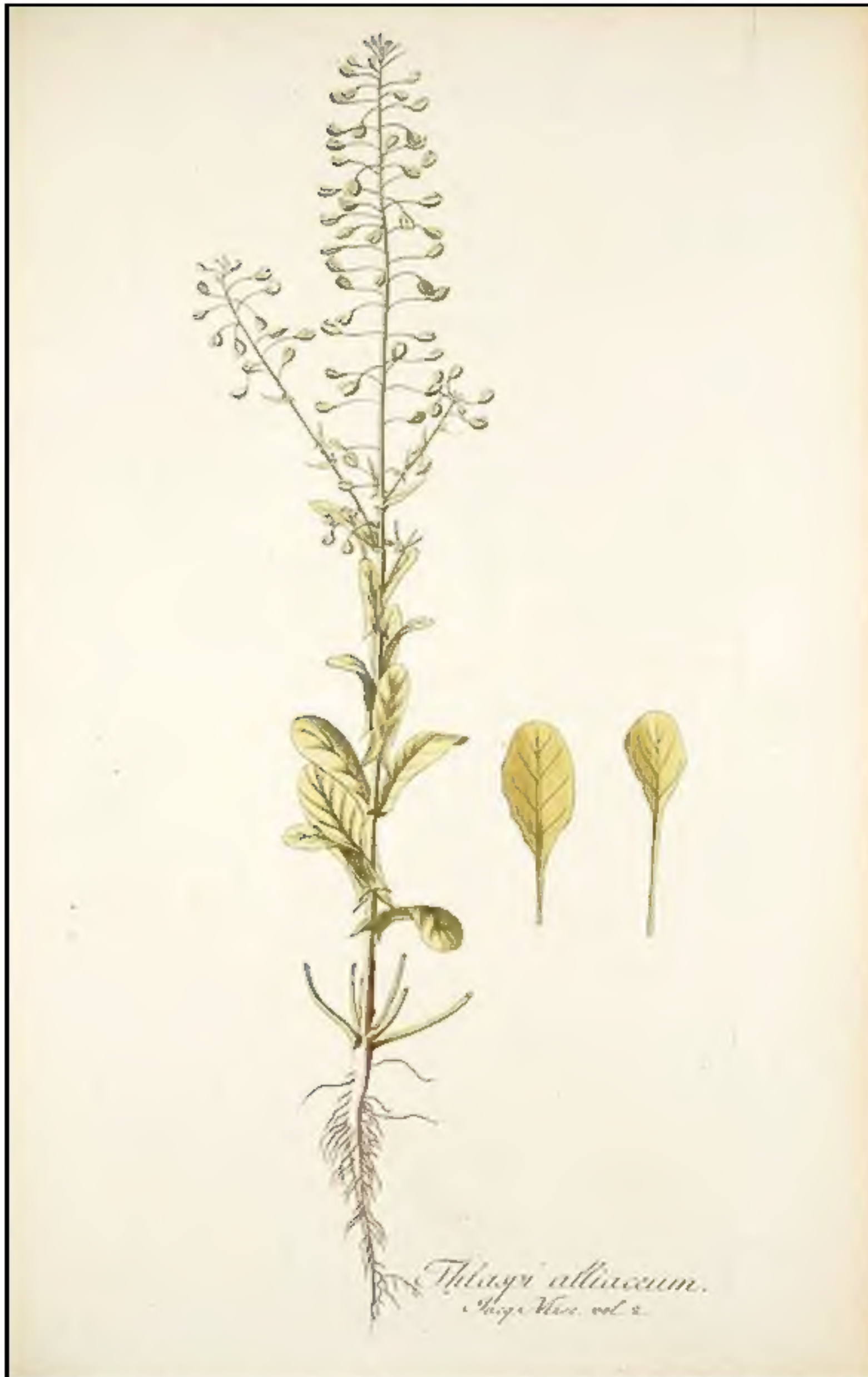
Figure 1. Thlaspi alliaceum L. in Icones Plantarum Rariorum , Vol. I, Plate 121 (Jacquin 1781-1786).