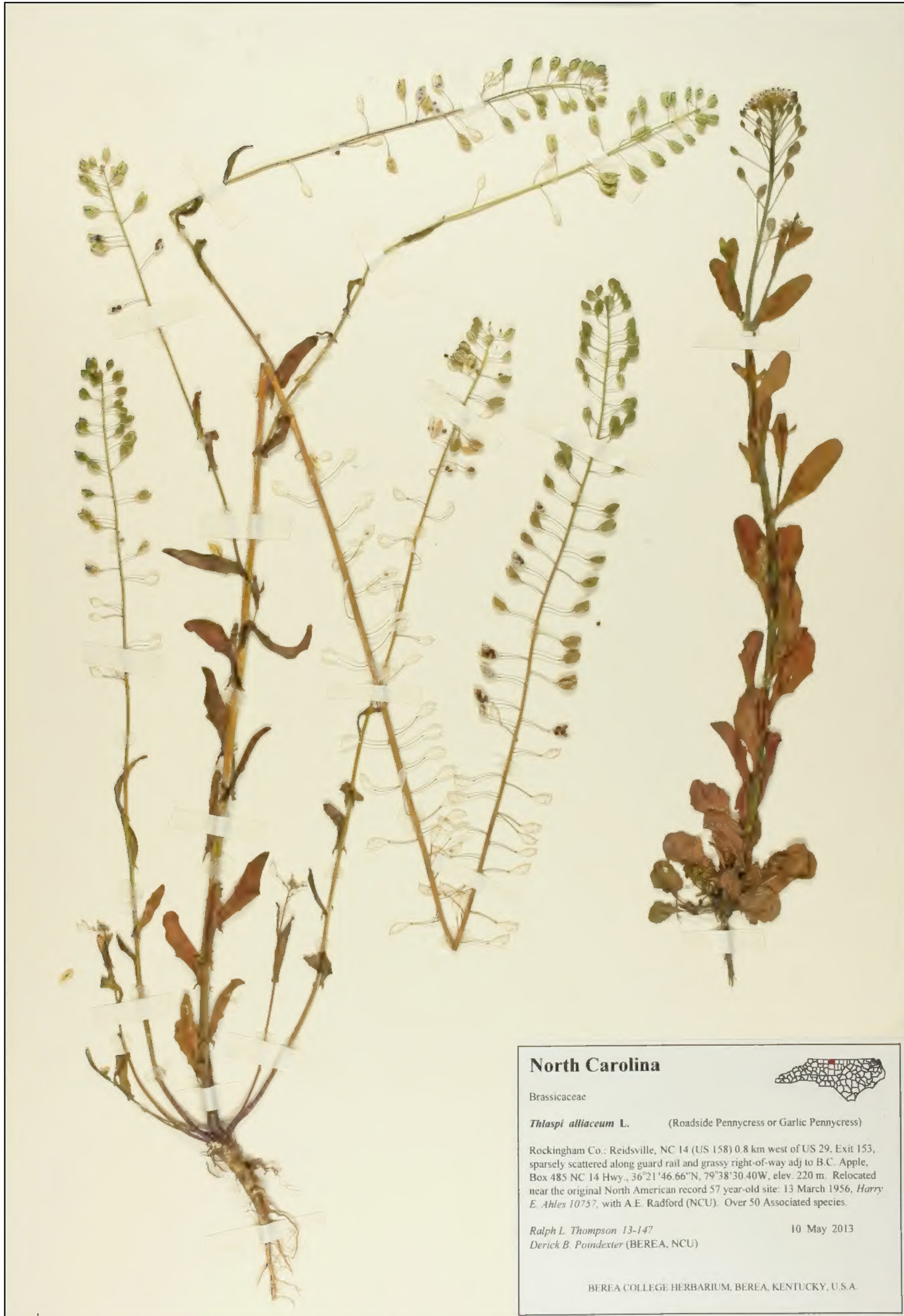
Figure 5. Thlaspi alliaceum , rediscovered in Rockingham Co., North Carolina (Thompson & Poindexter 13-147, NCU).