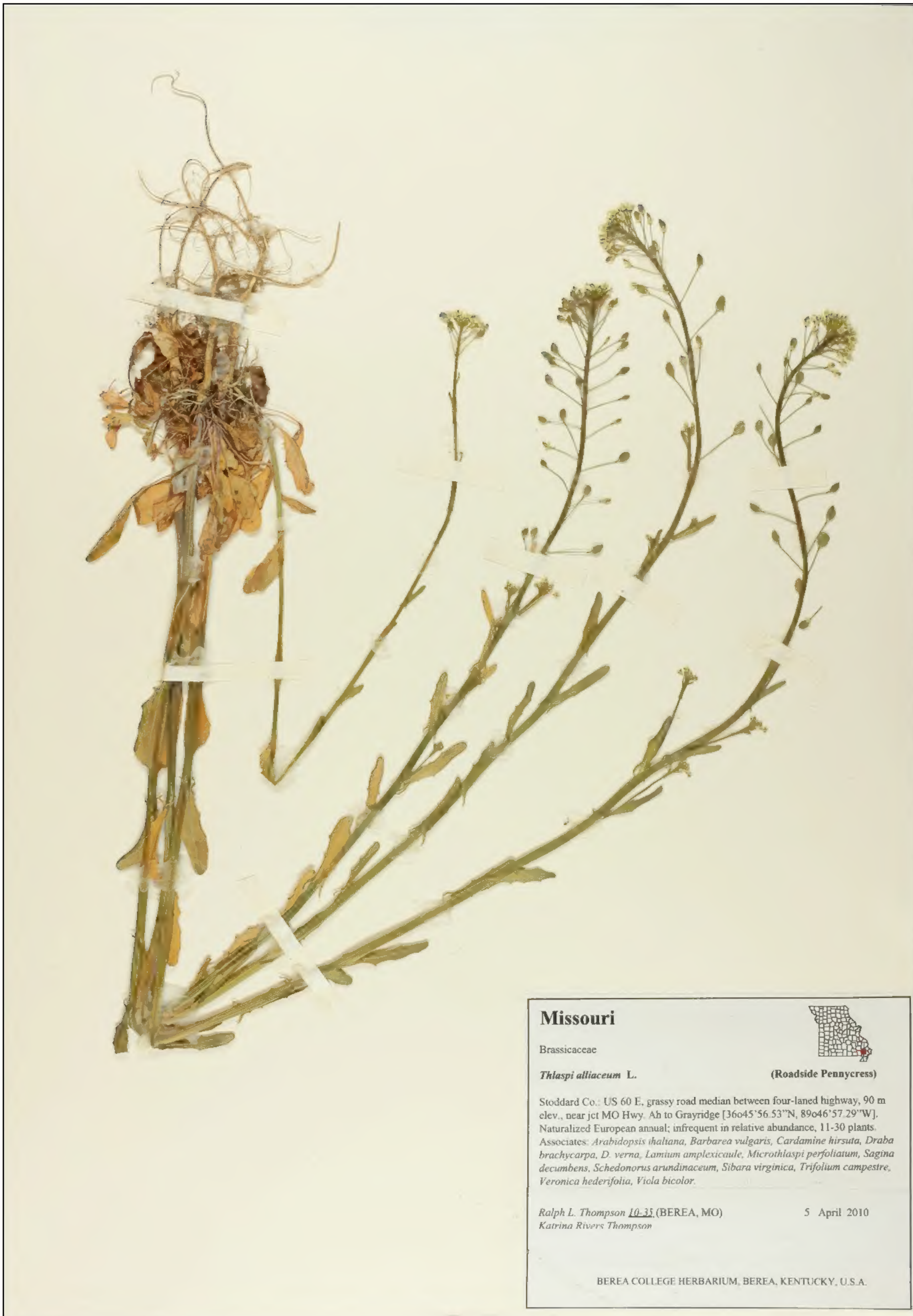
Figure 3. Thlaspi alliaceum in Stoddard Co., Missouri (Thompson & Rivers Thompson 10-35, NCU).